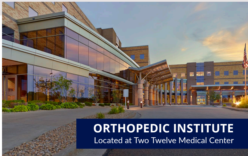
ORTHOPEDIC INSTITUTE Located at Two Twelve Medical Center